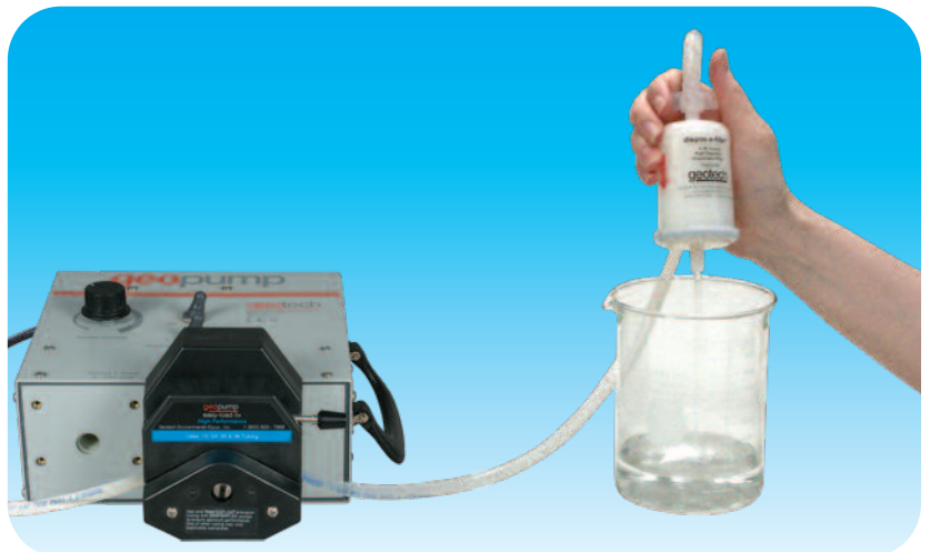
Sample collection with the Geopump™ Peristaltic Pump Series II with optional easy-load II® pump head (dispos-a-filter™ capsule sold separately)