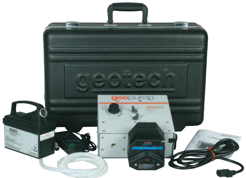
Geopump™ Peristaltic Pump Series II Kit with optional easy-load II® pump head, modular battery, 5 ft. (1.5 m) tubing, carrying case and power cord