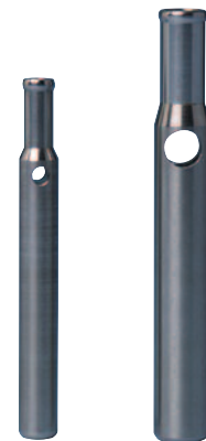
Geopump™ Tubing Weights