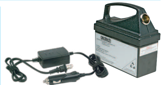
Geopump™ Modular Battery and Charger