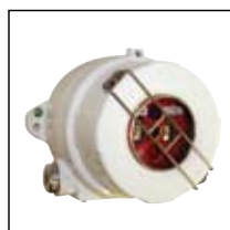
UV and UV/IR Electro-Optical Digital Fire and Flame Detectors