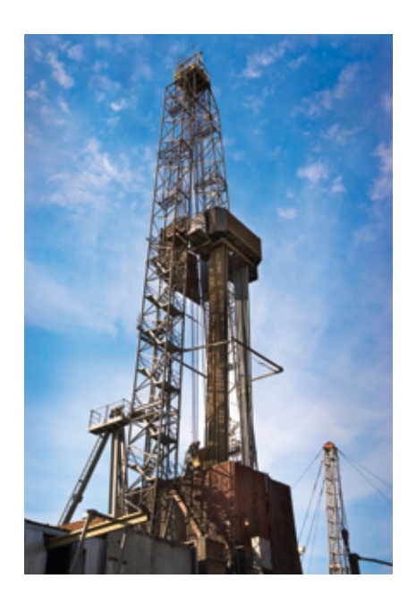
MeshGuard wireless gas detectors are designed for use in the harshest outdoor environments such as drilling rigs and in other industrial applications