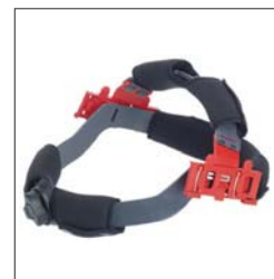
Quick Release Headband