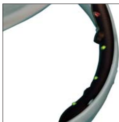
Unique Head Mounted Display (HMD)