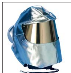
Radiant Heat Kit/Tinted Gold Visor (Optional Accessory)