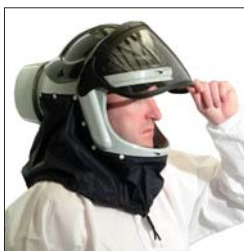
Fixed or Flip Up Visor Flip Up Visor may be locked closed.