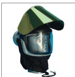
Shade 5.0 Green Visor (Optional Accessory)