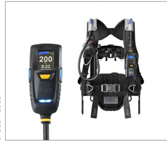
Dräger PSS AirBoss Connect