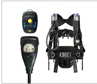
Dräger PSS AirBoss Agile