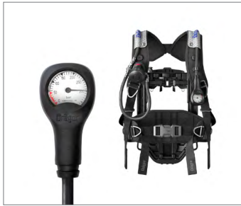
Dräger PSS AirBoss Active