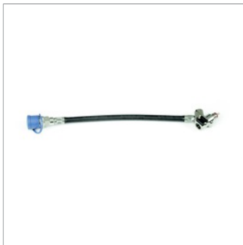
Secondary Supply Hoses