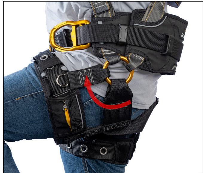
Full range of unrestricted movement