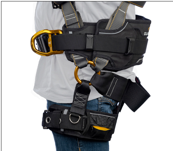
Unique O-Ring chasis design

The B7-Comfort's unique Three-Six-O harness chasis design keeps the harness fully integrated while allowing the torso and sub-pelvic & legs to move independent of each other. This lends to a full range of unrestricted movement of the hip joint for unrivaled mobility around the job site.