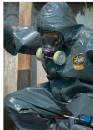
Zytron® 500 gas-tight styles features new AntiFog Visor. (note: old vs. new comparison shows Frontline® garment)