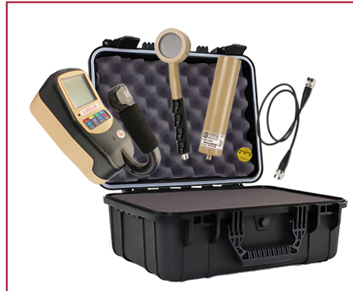
Part Number: 48-4178