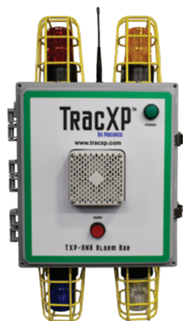
TXP-ANA Wireless with Hush