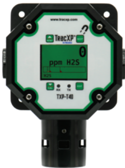
TXP-T40 Poly Housing