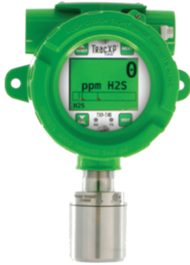
TXP-T40 Aluminum Housing