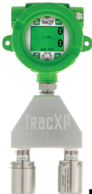
TXP-T40 Aluminum Dual Sensor

The TracXP T40 transmitter is a highly configurable fixed gas detector supporting single or dual sensor applications in Class 1 Division 1 or Class 1 Division 2 environments. Local and remote sensor options allow the T40 to adapt to a wide variety of industrial applications. TracXP intelligent sensors simplify sensor installation and configuration by transferring sensor information to the transmitter including sensor type, measurement range, calibration span values, last calibration date, serial number, and manufacture date. A vivid status indicating color display and LED notification provide superior visual verification of safe or unsafe conditions. Intuitive non-intrusive magnetic interface and embedded webpage make setting up and programming easy. Aluminum, Non-metallic (Poly), and Stainless-Steel enclosures provide alternatives to meet a wide variety of application and cost requirements.