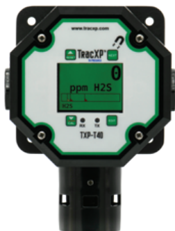
TXP-T40 Poly Housing