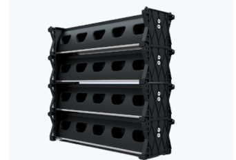
WatchGas SST Range 5-Way Stackable Charging Cradle P/N: SST-STACK-CHR (Extra's are needed)