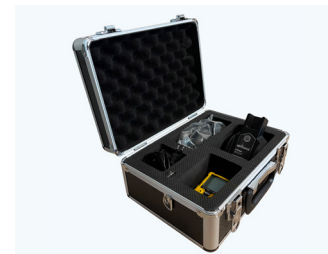
SST4 Micro/Mini aluminium kit P/N: 460039