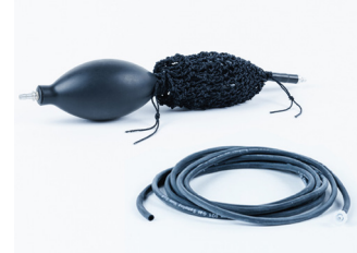
Aspirator bulb/pump with flow control for diffusion models P/N: 7189201 Advised to use with Last-o-More tubing