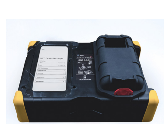
SST Dock P/N: SST-DOCK