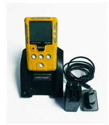
Universal cradle charger for SST Range P/N: SST-IND-S