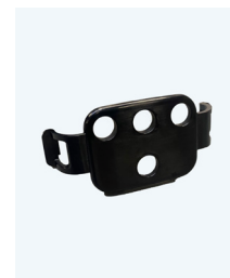
External filter P/N: SST-MICRO-XFIL-10 P/N: SST-MINI-XFIL-10